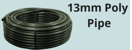
13mm Poly Pipe