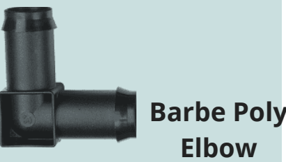
Barbe Poly Elbow