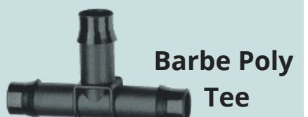
Barbe Poly Tee